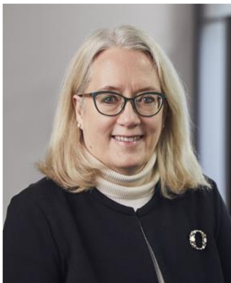
IASB Board member