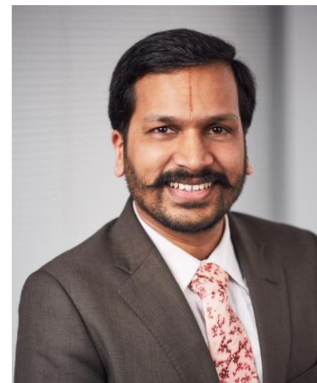
IASB technical staff