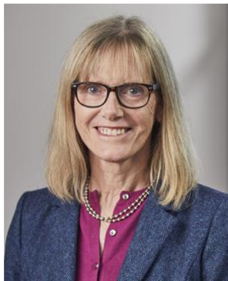
IASB Board member